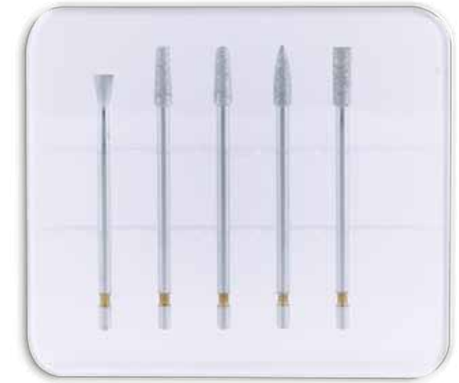
KIT 8000 – Zirconia