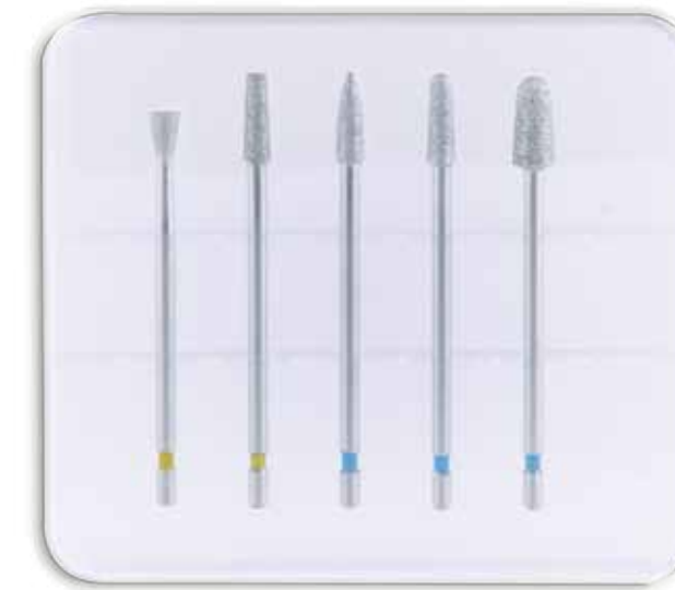
KIT 3000 – Ceramics