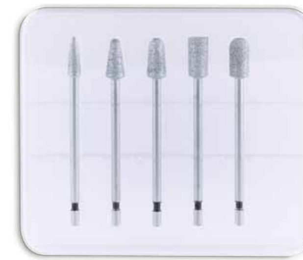
KIT 6000 – Super Coarse for Alloys