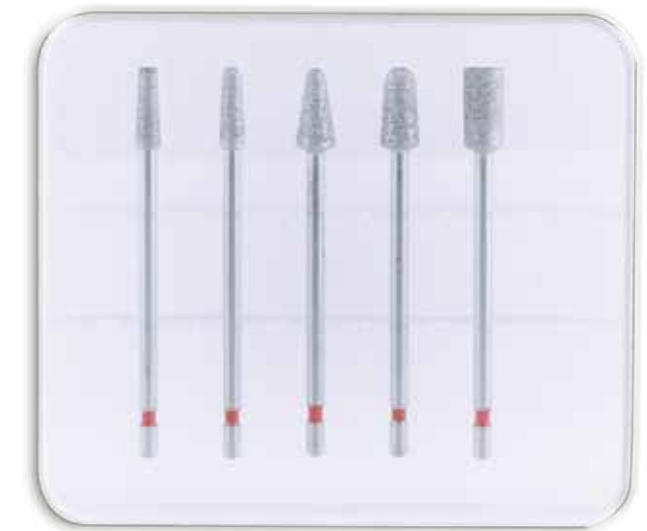
KIT 5000 – Coarse for Alloys